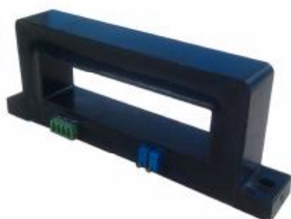
Figure 1, Appearance of the product